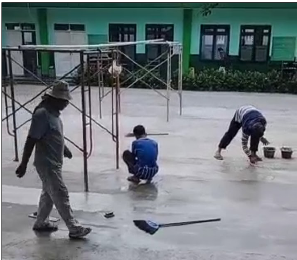
Workmen completing the playground in the Secondary School

We were pleased to be able raise the funds in order to carry out the necessary work and the playground has now been built.