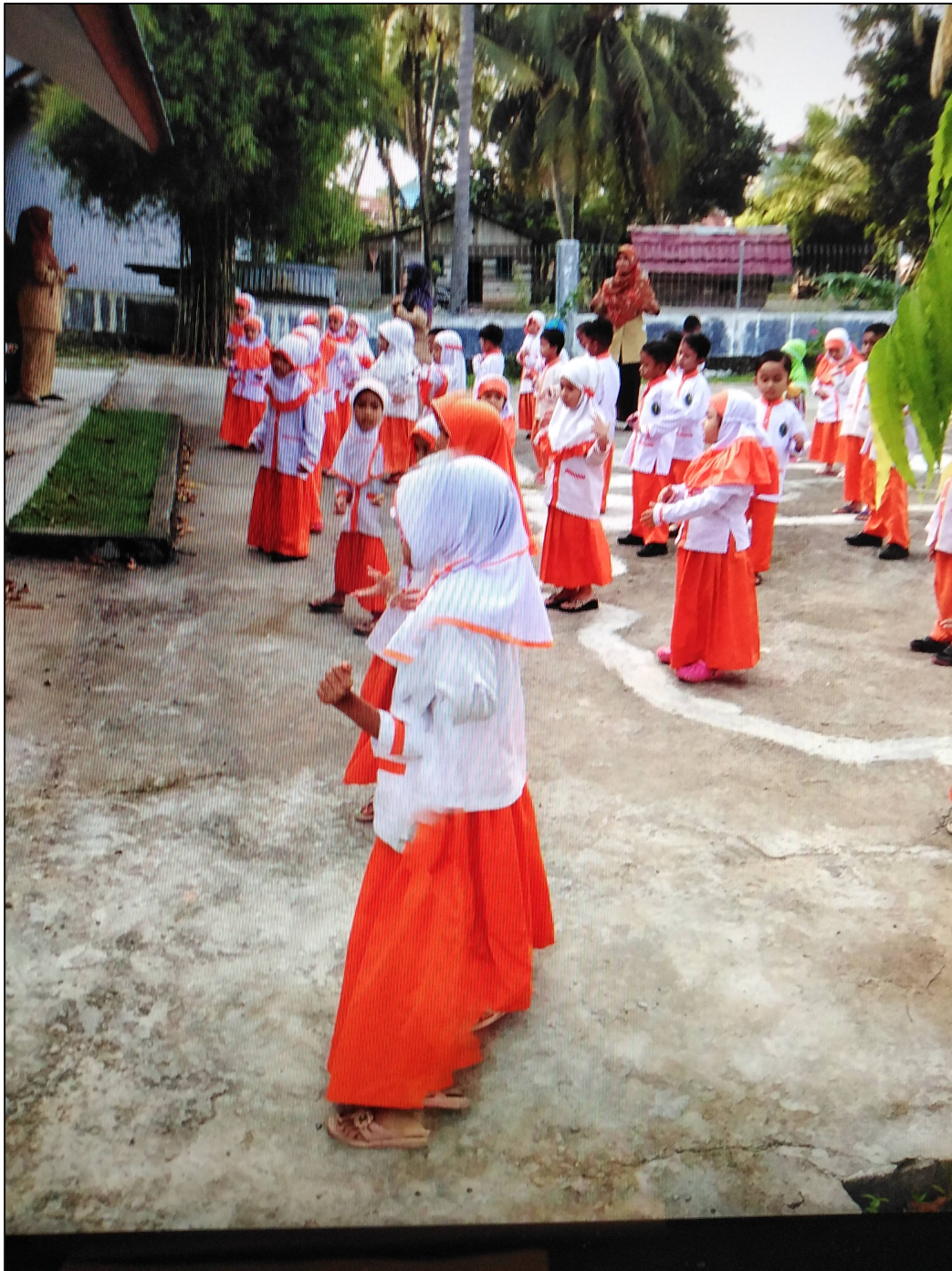
Nursery children doing their daily morning exercises before lessons start.

Despite all the challenges faced this year, our nursery schools have been accredited with an A rating and received an accolade from the local government for being a model school. With the struggle to contain Covid-19, many schools in Indonesia have not been in a position to safely re-open. However, the process was fast-tracked by our teams in our Aceh school. With the help of your donations, we were able to coordinate limited offline classes. Despite this achievement, we now face a new challenge in the number of educators available. The recruitment process is still in progress.